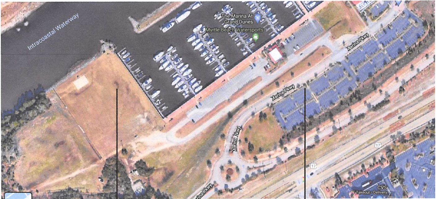
Marina Park (see attached full site plan)